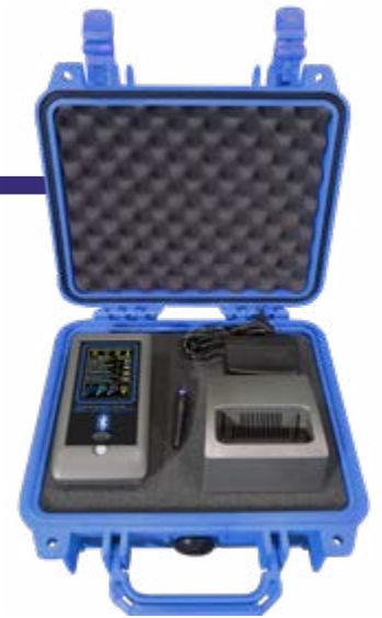
BlueSleuth includes a rugged hard case, charging dock, direction finding and omni antenna