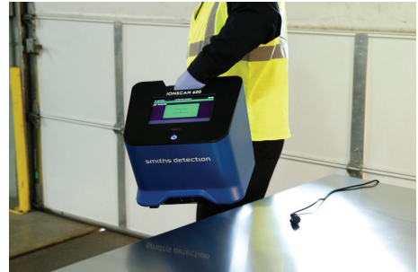
Lightweight and easily portable for dynamic security screening environments. Carry handle available only on non-printer unit.

For product information, sales or service, please go to www.smithsdetection.com/locations