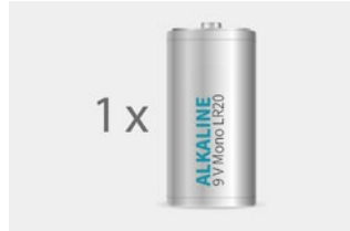
Alkaline battery 9 V block Item No. 5910001004