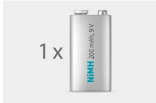
Rechargeable battery NiMH 9/200mAh Item No. 5920001001