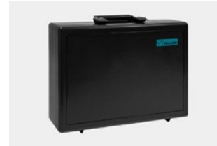
Carrying Case Item No. 8900330006