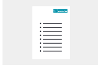
Operation manual MH6 Item No. 8900340300