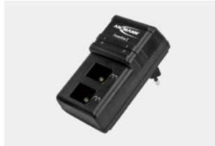
Charger Item No. 5900002010