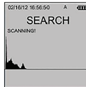
Real-time spectrum display