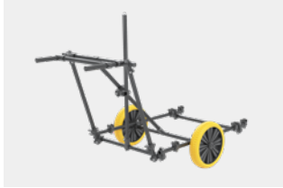
Wheeled Carrier VMXV1