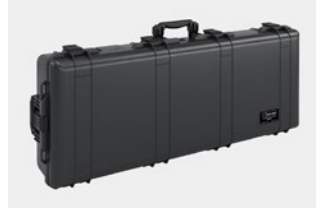
Case VMXV1 Item No. 2903220560