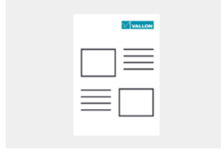
Assembly and operation manual VMX1 Item No. 8903220950