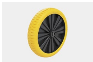
Spare wheel VMXV1 Item No. 2903220500