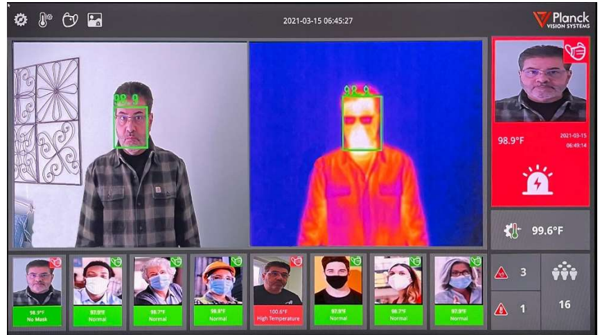
ThermaCheck M1 has a powerful and easy-to-use HDMI interface.