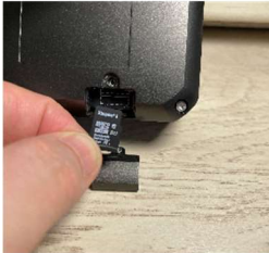
Secured SD Card Compartment