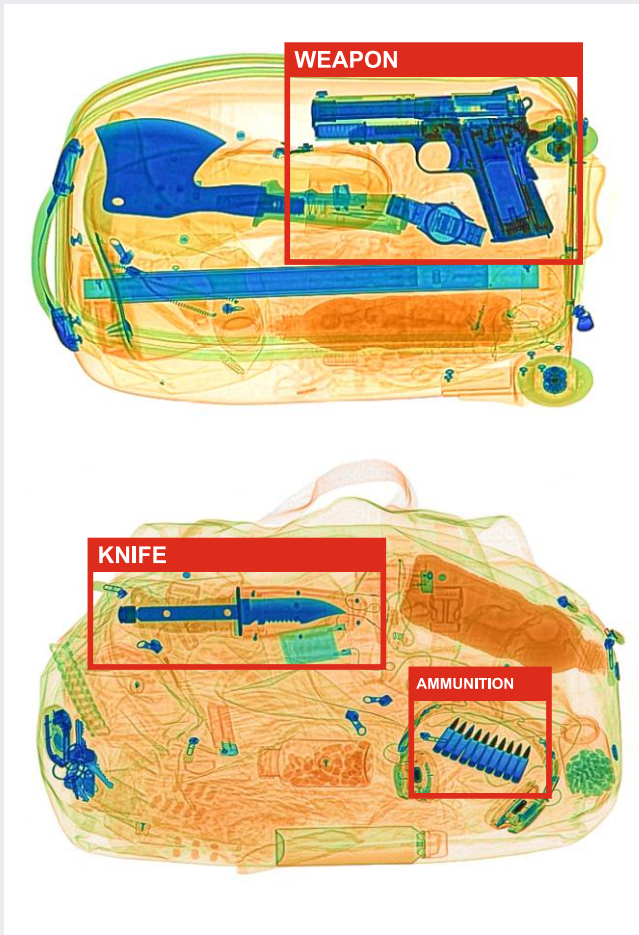
Examples of Images with Automatic Threat Detection by the AI Software System